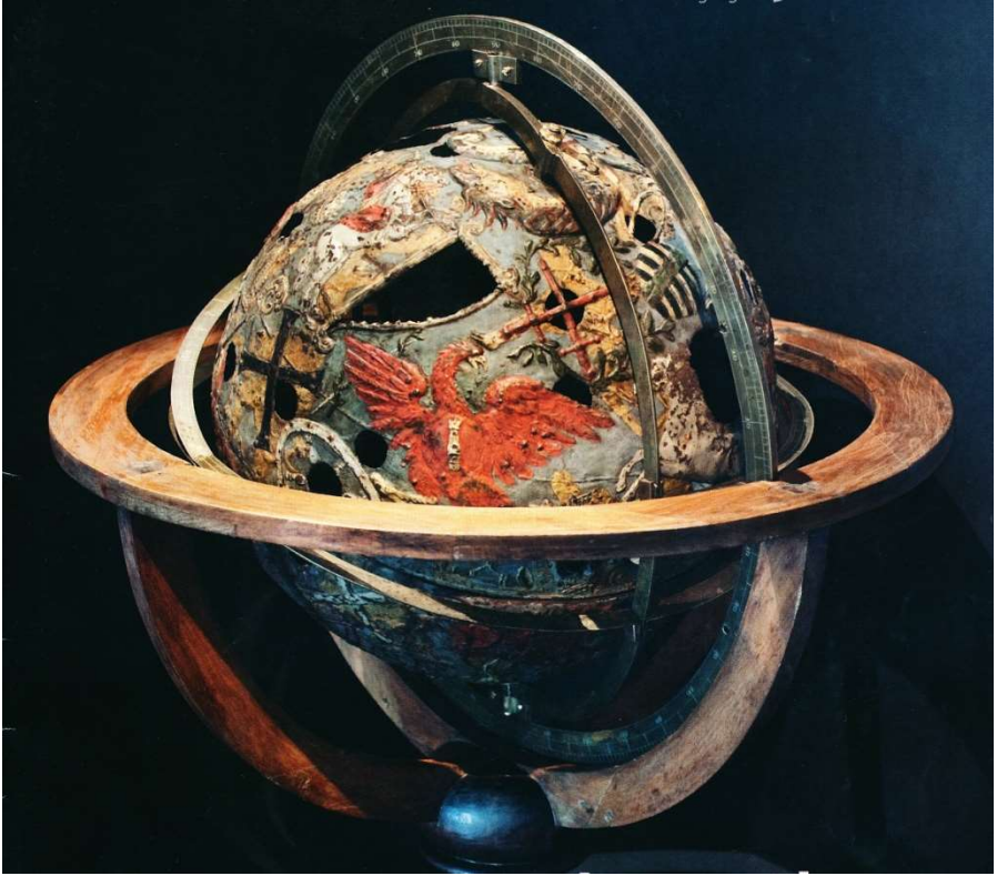
Heraldic celestial globe by Erhard Weigel (Trondheim, NTNU Vitenskapsmuseet)

In addition to these small globes, Weigel invented the type of "planetarium". This is a sphere up to 6 metres in diameter into which you could walk and in whose iron shell holes were pierced and arranged in such a way that sunlight shone through during the day and the viewer inside could recognise constellations with the indicated stars up to the third magnitude. Weigel combined this celestial sphere with some technology inside, which depicted the earth with the various phenomena (volcanic eruption, lightning, thunder, rain, fog), and thus created a "Pancosmos". Weigel had such a celestial sphere erected on the roof of Jena Castle.