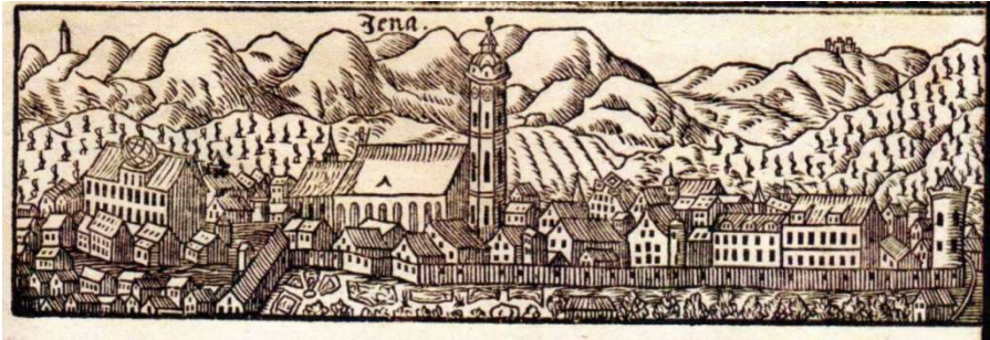
Jena with the castle (on the left edge of the picture) and the large celestial sphere on the castle roof (from Theophil Sternfreund: Geschichts=Calender für 1692)