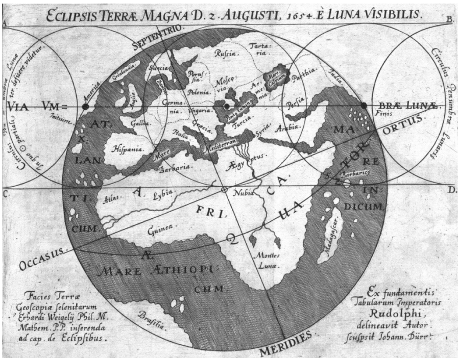
Drawing (copperplate engraving) showing the worldwide course of the solar eclipse on 2/12 August 1654 (from Erhard Weigel: Secundae Partis Geoscopiae Selenitarum Disputatio Secunda De Eclipsibus [...], Jena 1654)

In terms of scientific history, Weigel's dispute on the occasion of the total solar eclipse on 2/12 August 1654 is outstanding. Weigel dealt with this academically without any reference to astrology. He included the latest astronomical literature for the calculation of the course of the eclipse (degree of eclipse, times and duration) according to Johannes Kepler's Rudolphine Tables. He also made calculations that enabled him to produce a map showing the worldwide course of the zone of totality. This copperplate engraving (Fig.) is considered to be the oldest depiction of the course of a solar eclipse on the globe. 9